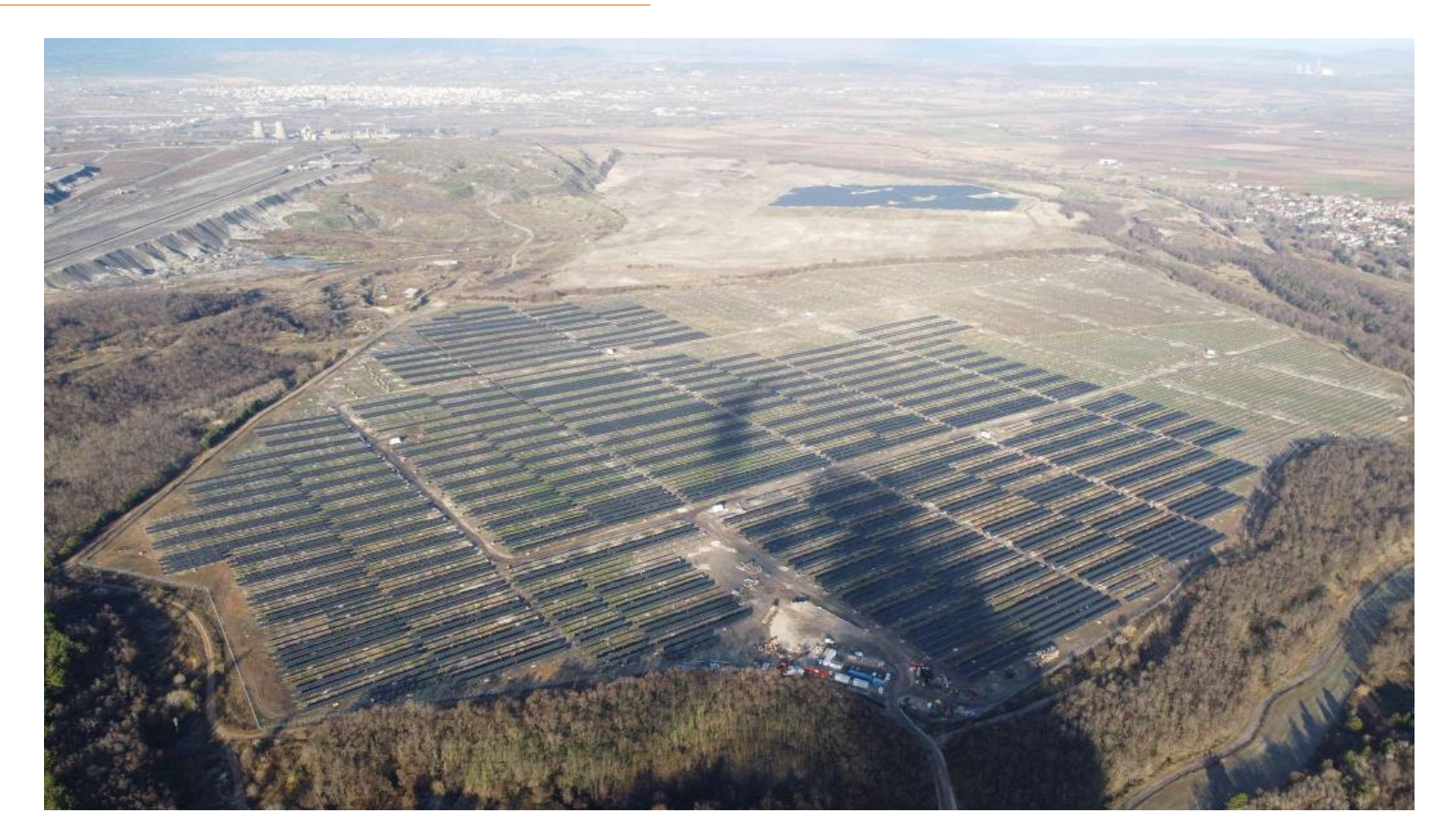
Greece: InvestEU - EIB backs "PPC Renewables" for 230MWp capacity solar farms to increase renewable energy production and support just transition efforts in Greece's Western Macedonia region